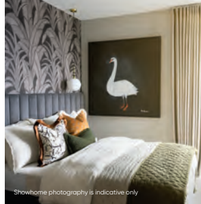
Showhome photography is indicative only.