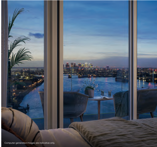
Computer generated images are indicative only.