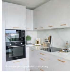
Showhome photography is indicative only.