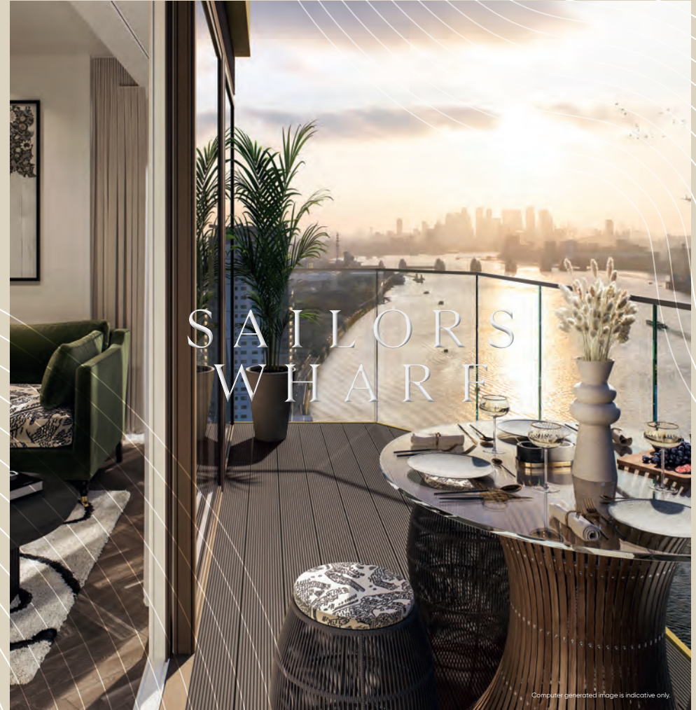
Computer generated image is indicative only.

Disclaimer: Please be aware that these details are intended to give a general indication of properties available and should be used as a guide only. The company reserves the right to alter these details at any time. The contents herein shall not form any part of any contract or be a representation including such contract. These properties are offered subject to availability. Applicants are advised to contact the sales office or the appointed agents to ascertain the availability of any particular type of property so as to avoid a fruitless journey. The property areas are provided as gross internal areas under the RICS measuring practice 4th edition recommendation. Prices and information are indicative only and may change. Please speak to a member of the Sales Team to confirm prices and availability.